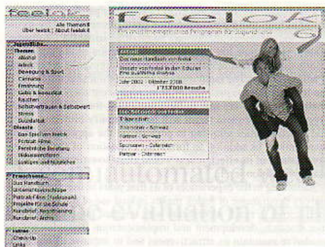
Figure 1: The homepage of feelok with indication of the 10 topics covered, services, background information for teachers and recent news

10 and 19 years in 2005 (N=436) 56.2% reported that they exercised twice or more often outside school hours. Therefore it was decided that the physical activity programme of feelok should address both physically inactive and active youths: The first in order to help them to become more active, the second in order to support them to remain active in sports.